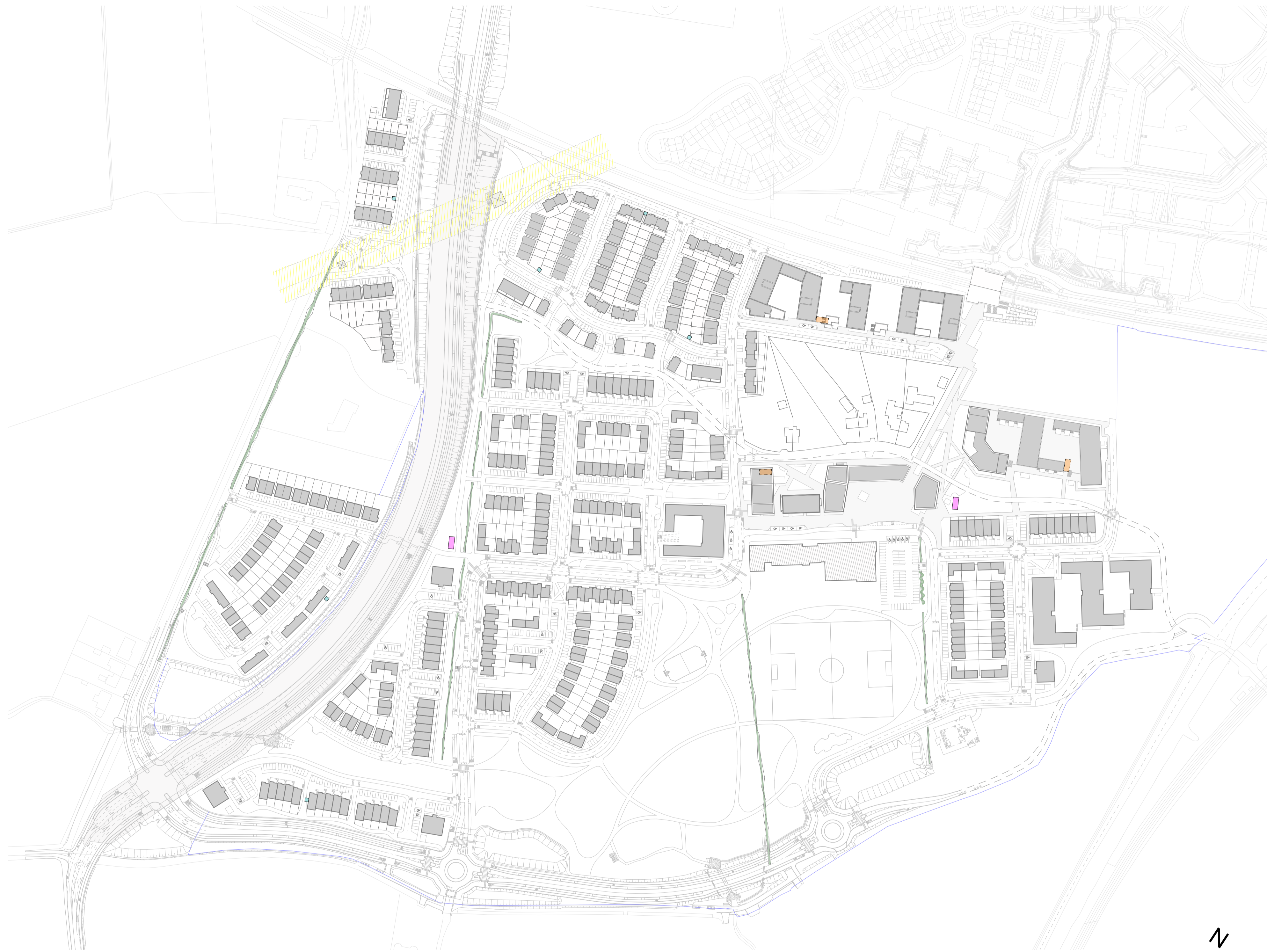
1:2000 ESB Substation Location Map

NOTE: Refer to CSEA Consulting Engineers drawings for topographical survey, proposed levels, retaining structures, traffic lighting and drainage details. Refer to Gannon + Associates drawings for Landscape Layout and details.